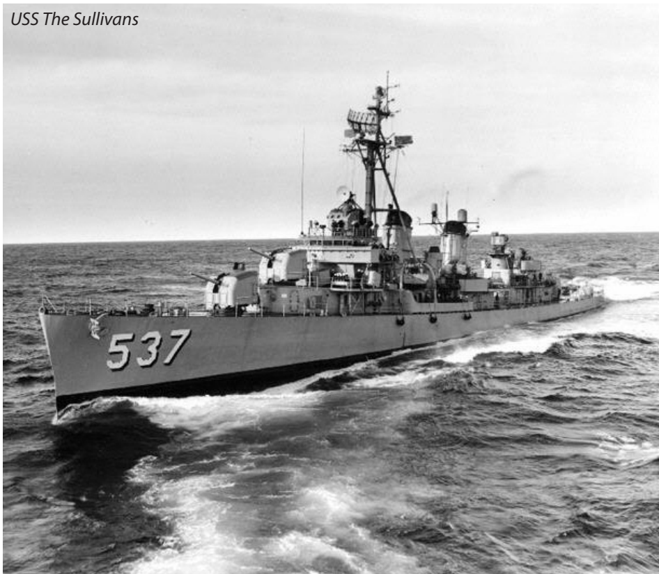
USS The Sullivans